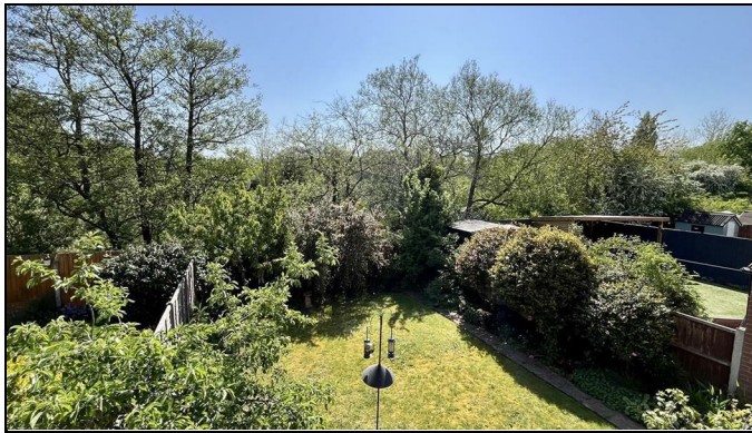
Blakesley Close, Sutton Coldfield, B76 1EF